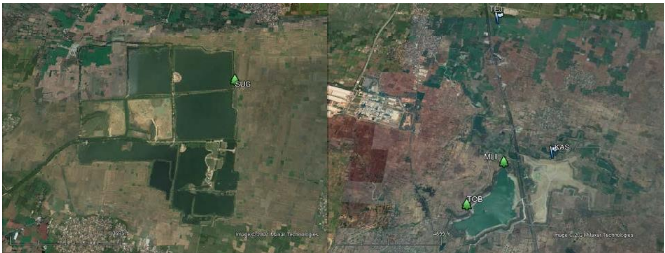
Figure 1. Location area research lime stone and clay

Sampling of macrozoobenthos was carried out in the Sugihan (SUG) and Mliwang (MLI) areas by direct hand collecting method and with the help of a scoop net which was swept on the edge of the water body, especially in vegetated areas. The target specimens in this sampling include larvae of insects, crustaceans, small molluscs and other invertebrates. The research locations are limestone and clay areas as shown in Figure 1.